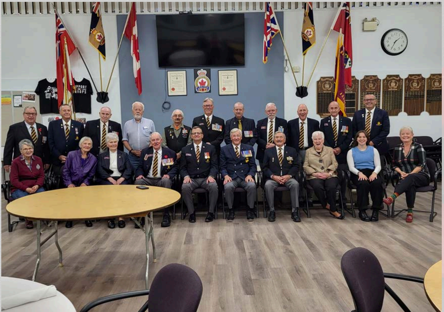
110th Celebration Photo – Calgary Branch – PPCLI Association

It was an enjoyable luncheon with good food cooked up by the Legion, some good stories and maybe a lie or two thrown in.