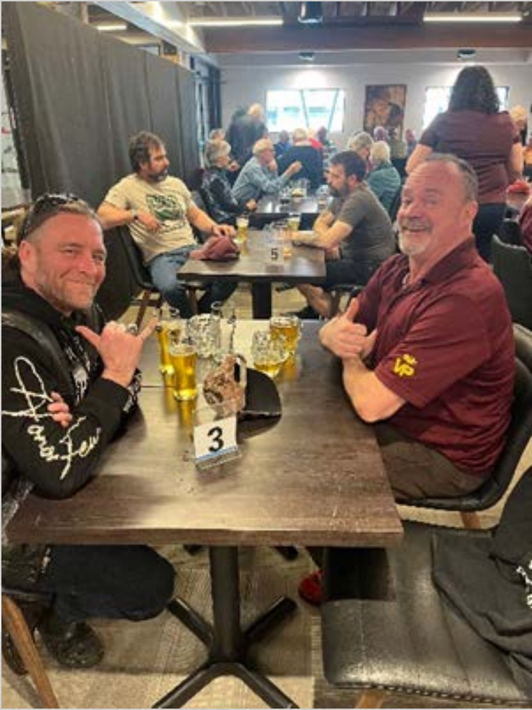
Regimental Day 2024 at a local Legion Branch.