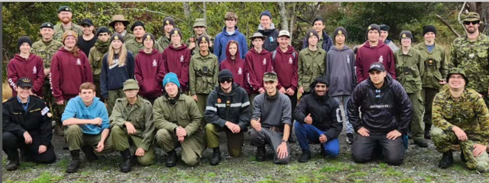
Corps at their Field Training Exercise in November 2023 at Albert Head Training Establishment