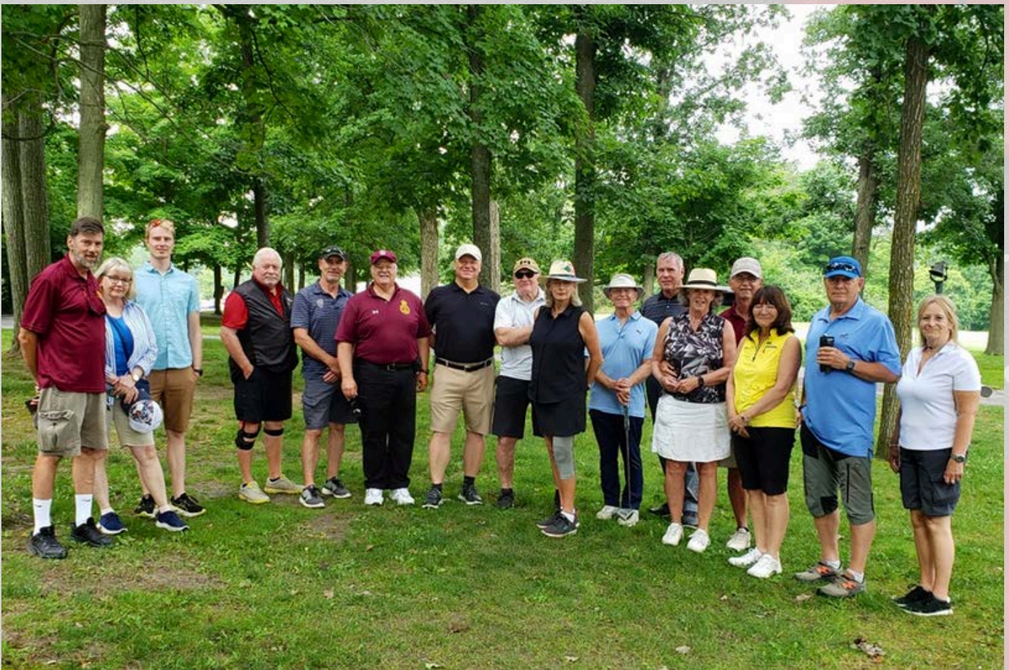
Kingston Branch Golf Tournament, Camden Braes 6 July 2024

The weather cooperated and a good time was had by all.