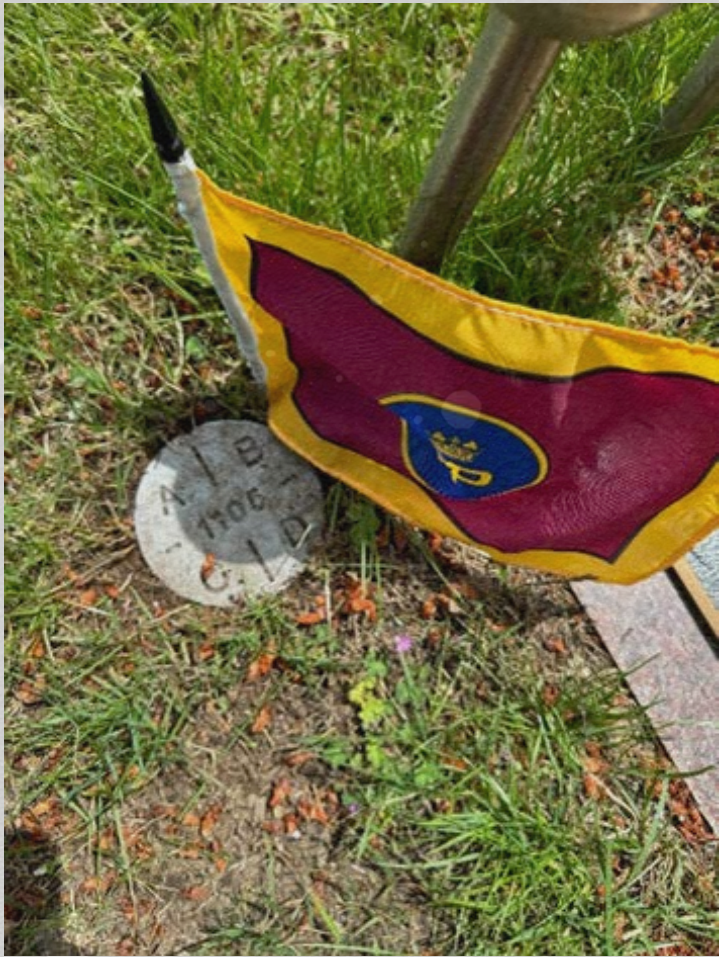
Camp Flag placed on unmarked PPCLI Soldier's grave recently.