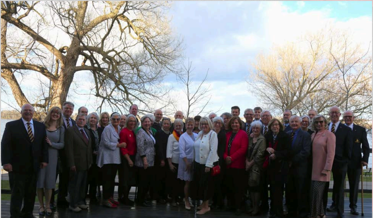
Kingston Branch Regimental Dinner, Rivermill Restaurant 20 April 2024

Thirty seven Patricia's attended, including eight from Ottawa Branch. Like all Kingston events a 50/50 draw, to benefit the Hamilton Gault Memorial Fund, was conducted.