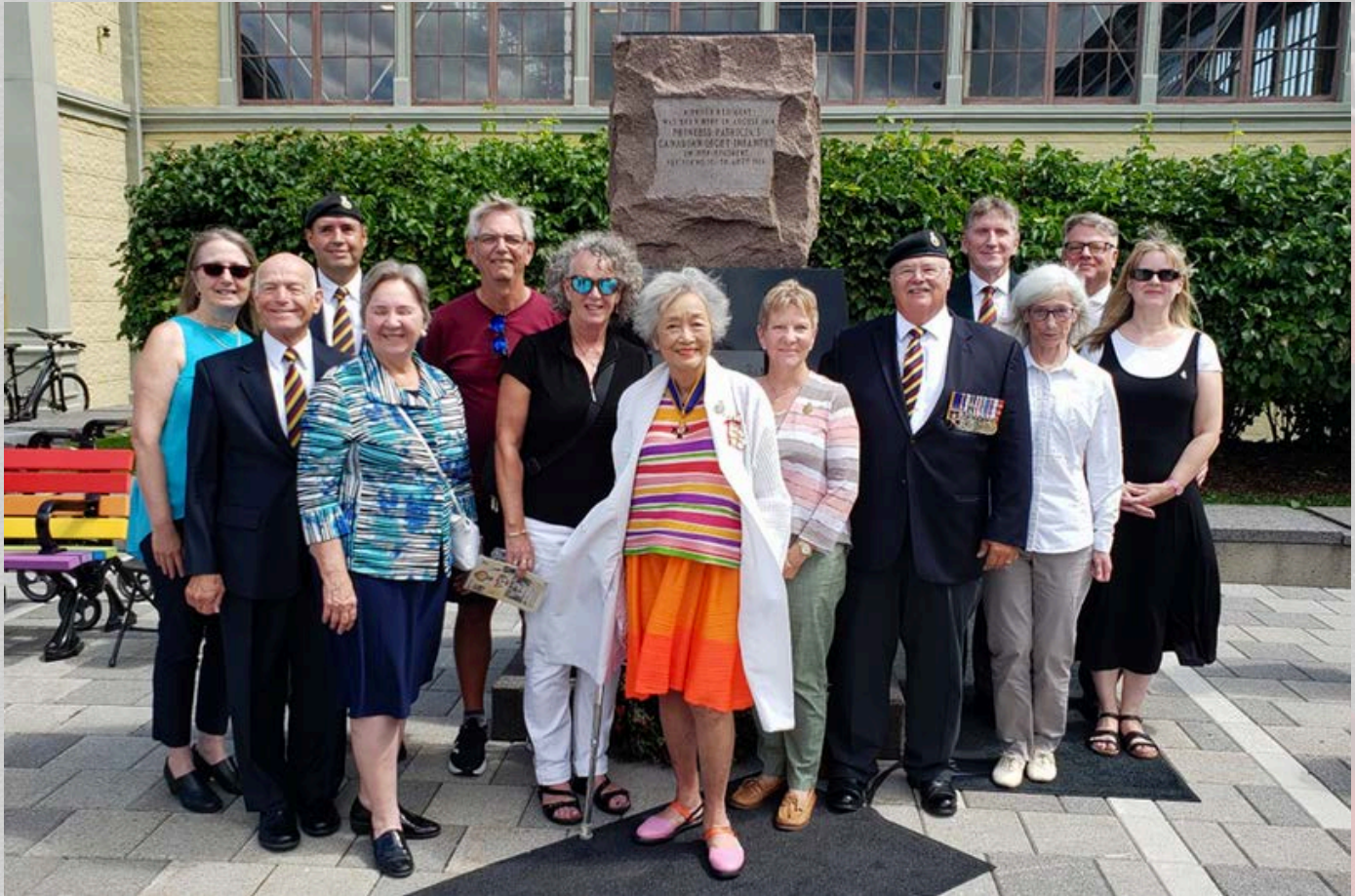
Ottawa 110th Commemoration Service 10 Aug 24 Kingston Patricia's with the Colonel in Chief