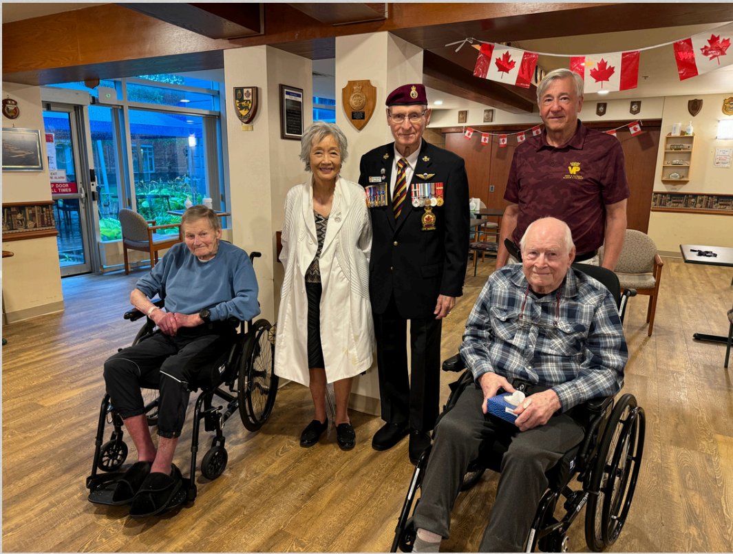
The Visit to Perley Health 9 August 2024