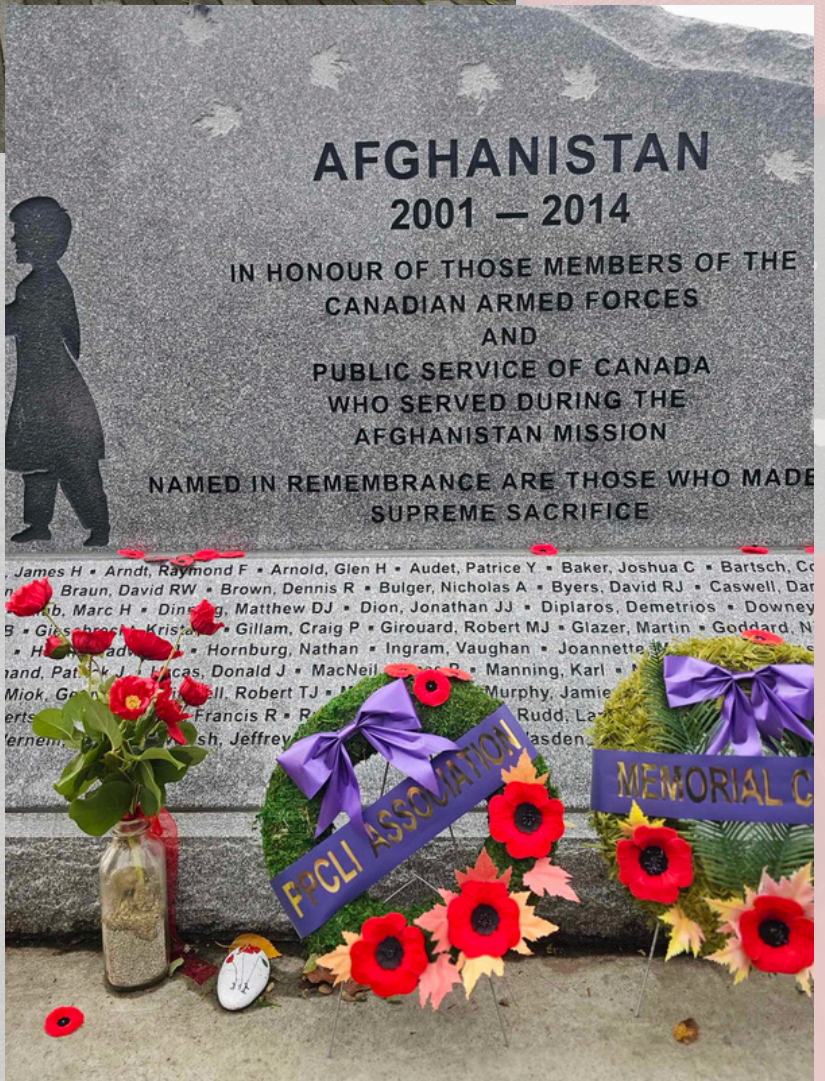
Location: Victoria, BC