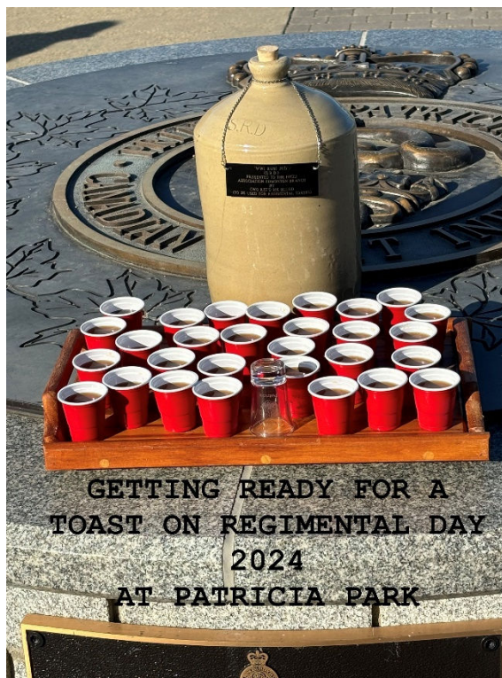
GETTING READY FOR A TOAST ON REGIMENTAL DAY 2024 AT PATRICIA PARK