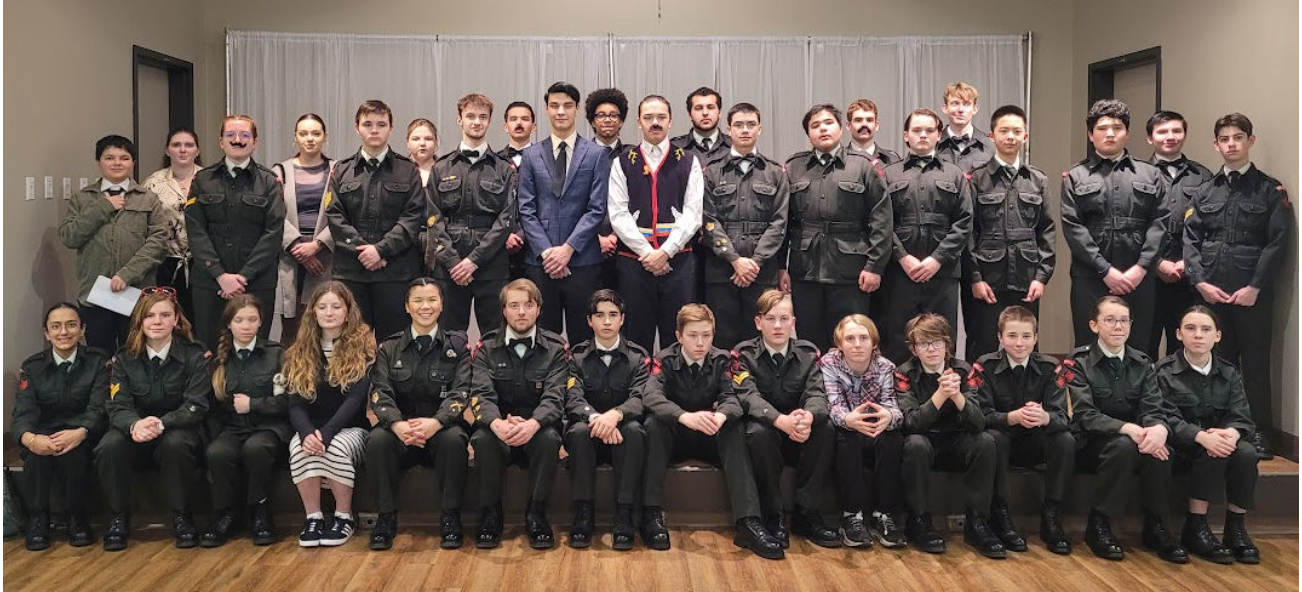
2483 RCACC corps at Mess Dinner