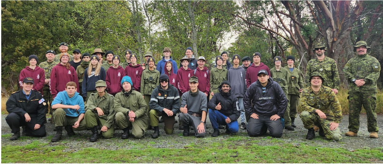
2483 RCACC corps photo at our FTX at Albert Head

2483 Princess Patricia's Canadian Light Infantry Royal Canadian Army Cadet Corps has had a very fun and packed year full of training so far. This marks our second full year in person since the pandemic and we have seen a lot of progress and changes at the unit we are excited to share with you all.