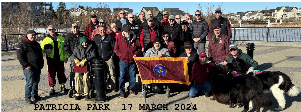
PATRICIA PARK 17 MARCH 2024

We celebrated Regimental Day on the 16 and 17 of March. On the 16 th we had a luncheon at a local pub and 65 plus attended. The morning of the 17 th we gathered at Patricia Park to Toast the Regiment and thank all those with names on walls to the entrance. We also toasted the Serving and of course the Association. On the 8 th May for Frezenberg Day we are having a Luncheon to celebrate. We are planning events ongoing during the summer. On 10 Aug at 1000hrs there will be gathering at Patricia Park to toast 110 years, followed by food and refreshments. The annual PPCLI Campout 10-11 Aug in Camrose this year will be extra special due to the 110 th Anniversary. Contact the branch for more details on these two events.