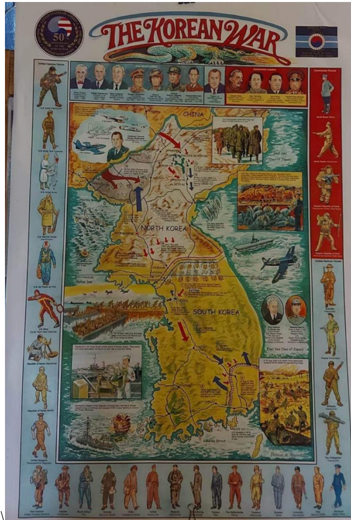
Poster sent to Korea as part of the Kapyong Commemorative Trail project – donated by the PPCLI Victoria Branch on behalf of the PPCLI Association