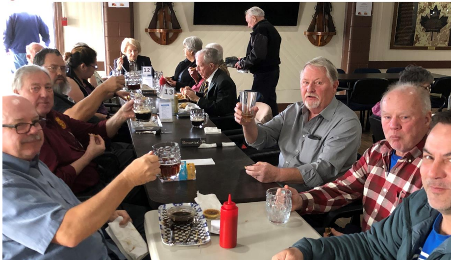
Raising a pint in honour of the anniversary of the PPCLI Regiment. The President was once again behind the camera.