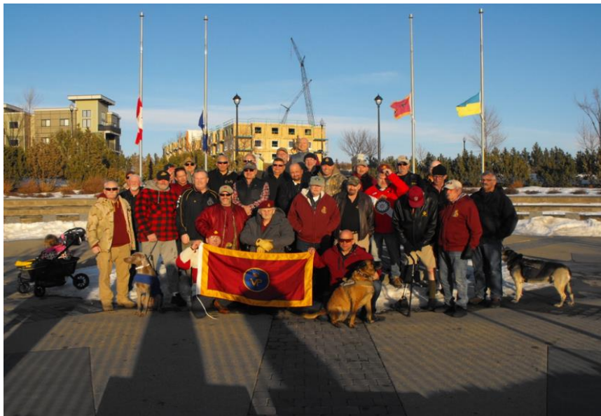
Front Row: L-R

We have 33 members plus attend our meeting on a regular basis, making for great conversations during and after the formal stuff. We are maintaining a steady strength despite losing members to the Battalions in the sky. In March, we celebrated the 17 March with many events. Started with members watching the First Battalion play Broom-i-loo in the morning. At noon, the local CannaConnect hosted local Patricia's with food and a cake. In the evening, there was a gathering at Patricia Park. A short brief of Lady P's life was read followed by a toast to her and the Regiment. The day ended with adult beverages in local pub.