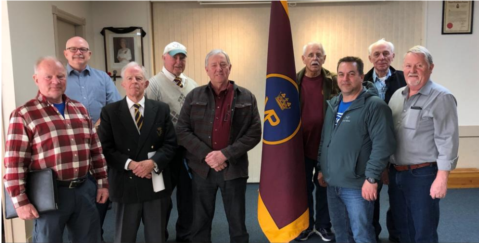
Nine of our ten members at our March 25 th meeting. The President was behind the camera.