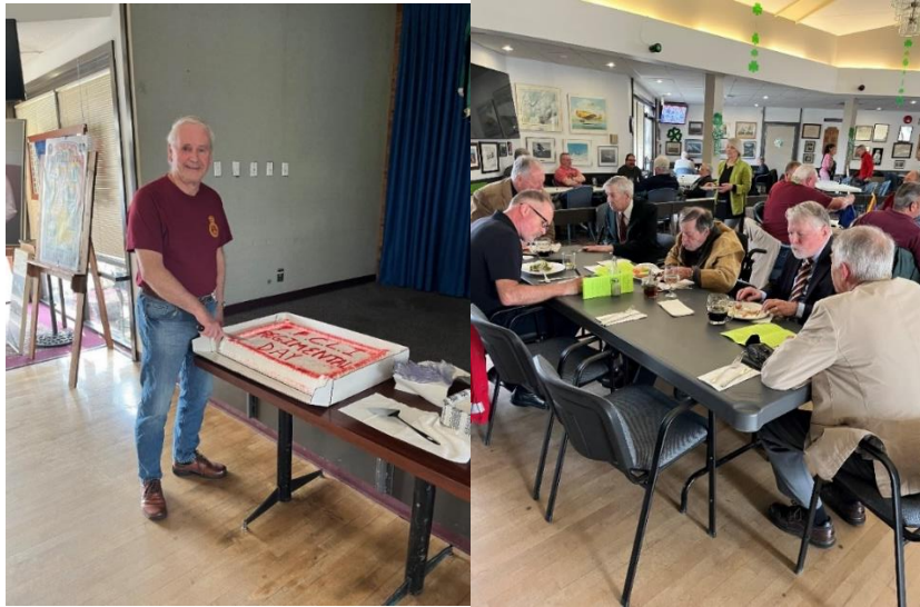
Regimental Day in Victoria 17 March 2023