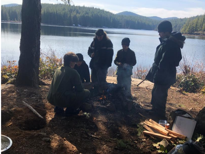
Enjoying a fire during a FTX at a local lake