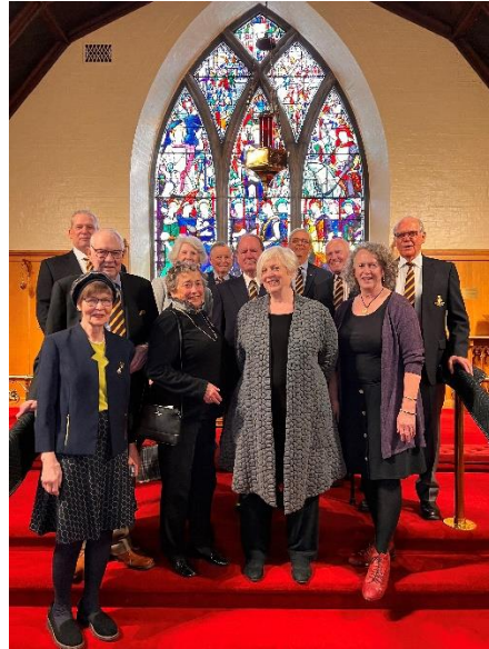
The Witnesses at St Bartholomew's, 12 March 2023

This project extends the important link between the Church of St Bartholomew with its spectacular Memorial East Window and the PPCLI.