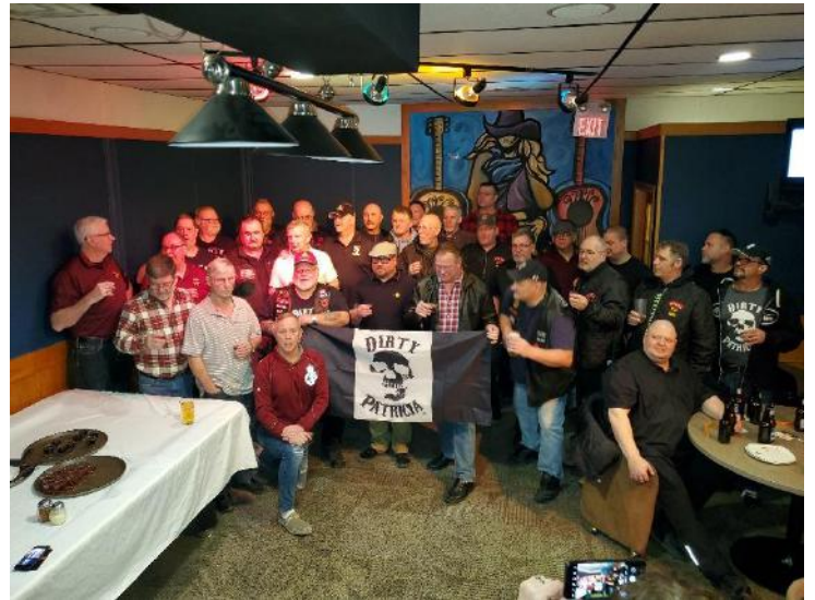
Toasting the Regiment 14 March 2020