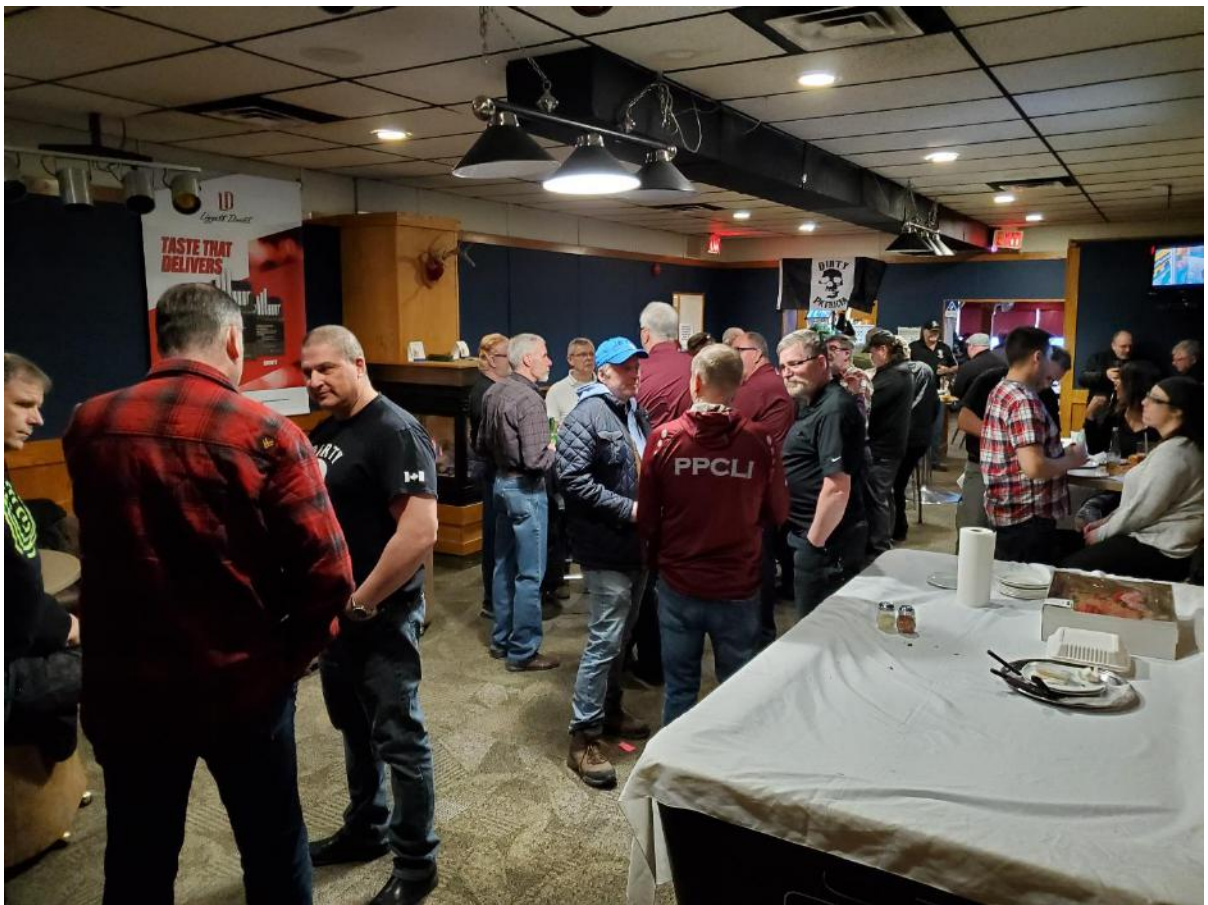
The time before social distancing