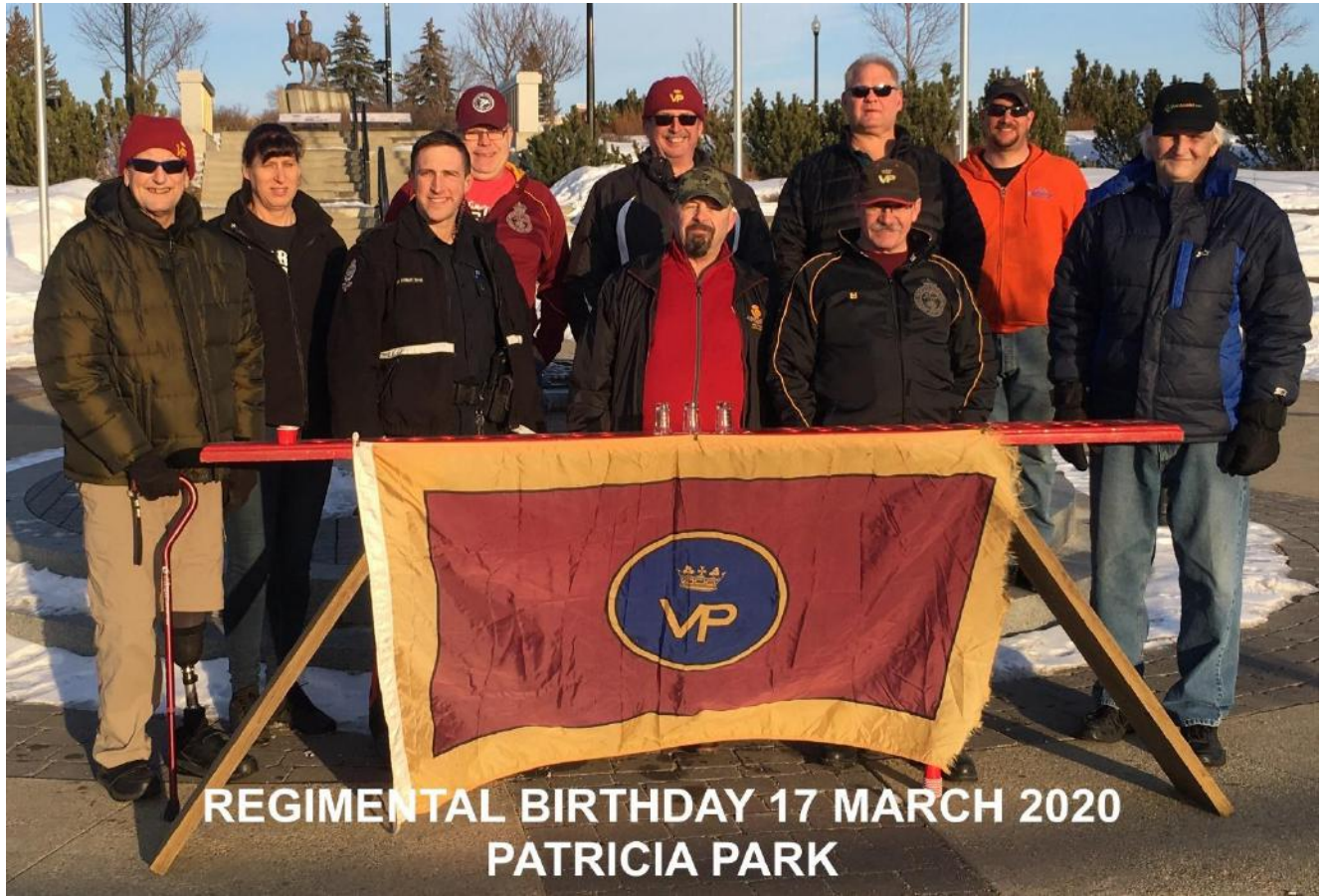
REGIMENTAL BIRTHDAY 17 MARCH 2020 PATRICIA PARK