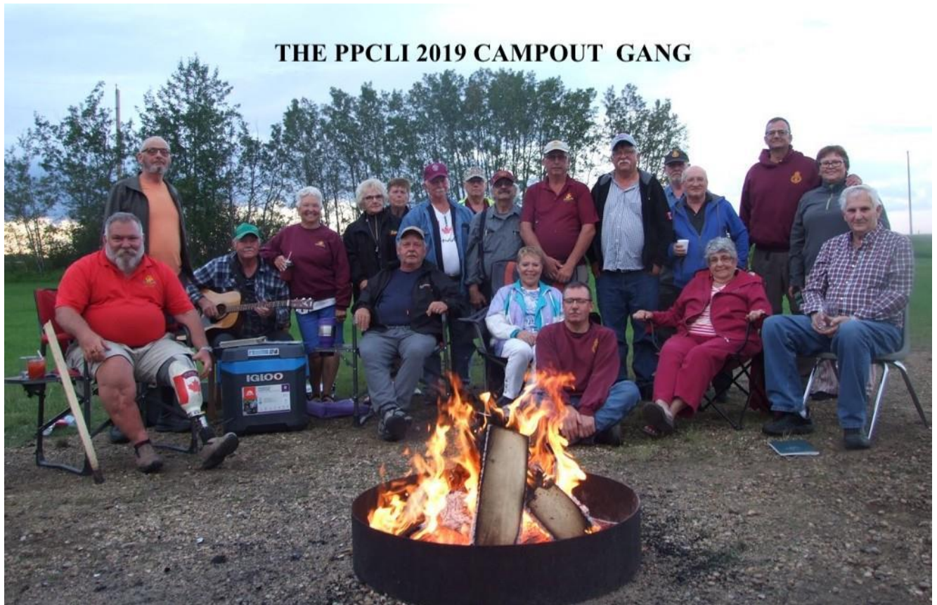
THE PPCLI 2019 CAMPOUT GANG