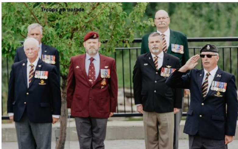
Patricias on Parade