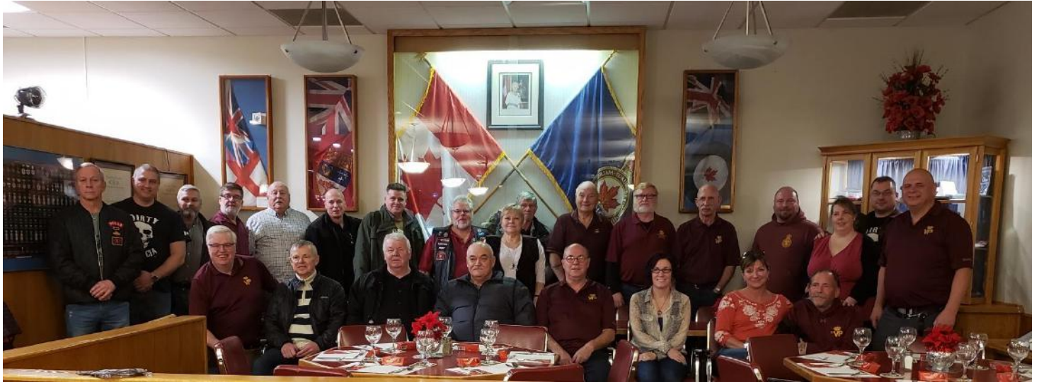
Manitoba and Northwest Ontario Branch AGM 14 Mar 2020