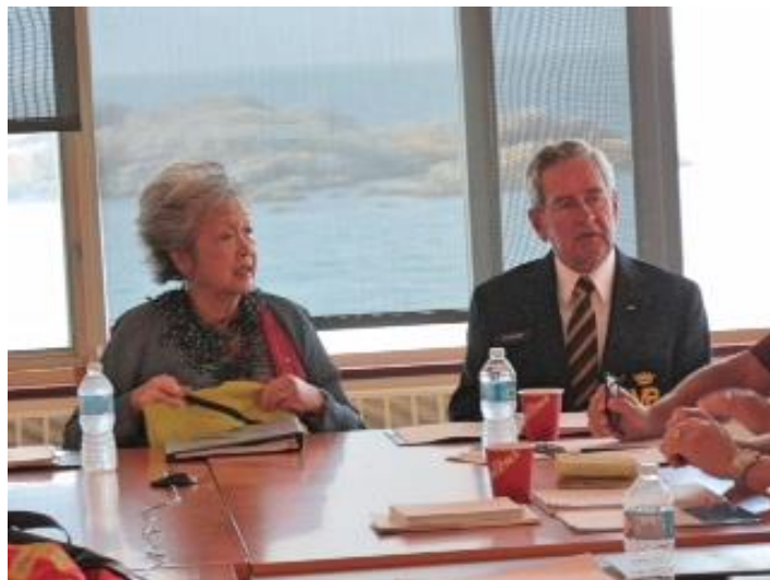
The C in C and COR during the Working Group