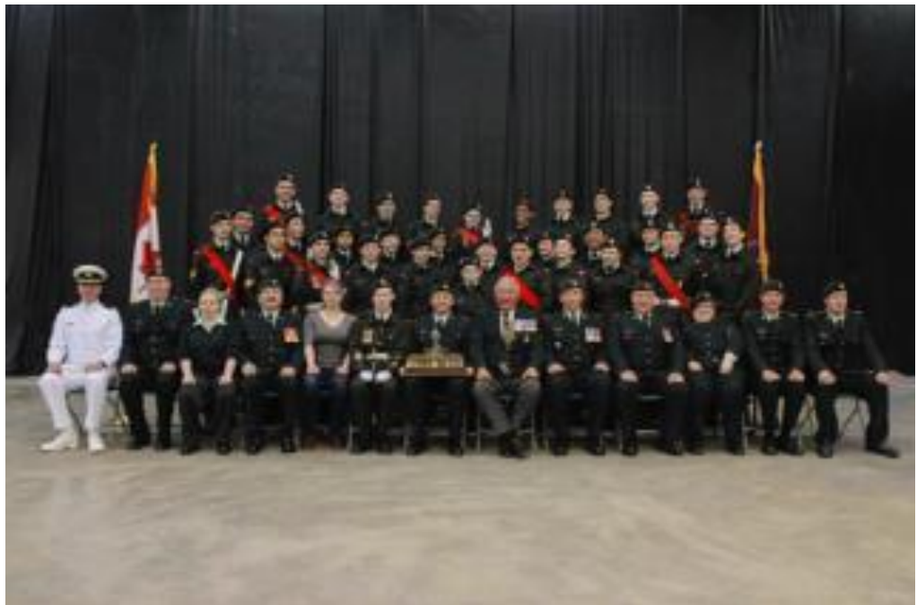
2276 (PPCLI) RCACC Fort St John

2276 (PPCLI) RCACC Fort St John has done fundraising for several years and the entire Corps will be going to Vimy in 2017 for the 100 th celebration.