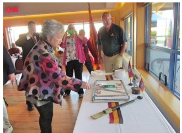
The C in C cutting the Cake at the BBQ