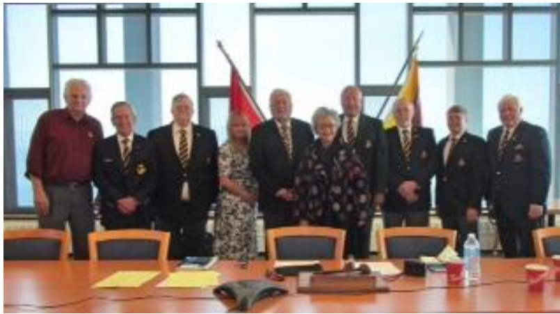
The National Executive with the C in C and the COR

The AGM was held in the Rainbow Room of the Chiefs and PO's Mess. Another gorgeous location overlooking the Ocean.