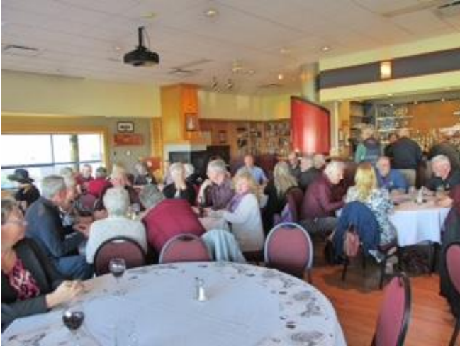
On Saturday evening we held a BBQ at the NOTC Gunroom in Workpoint Barracks with 84 attending. An excellent time was had by all