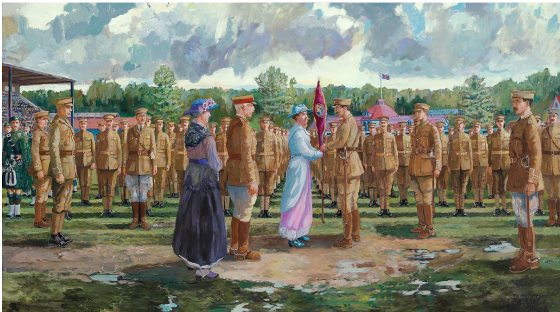
THE ORIGINALS AUGUST 1914