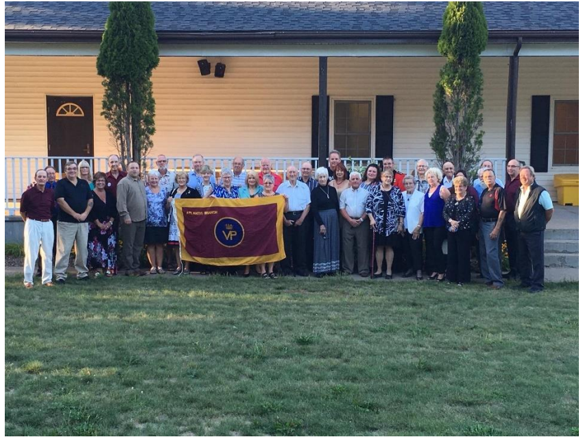
The Members of the Association meet for supper at Borden Hall, CFB Det Aldershot