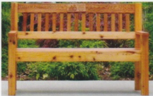
Above left: Photo of bench dedicated to the senior's residence.