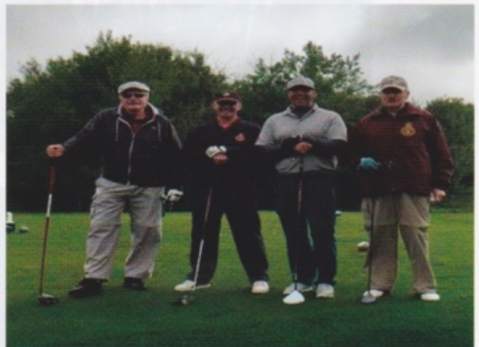
THE EDMONTON CREW