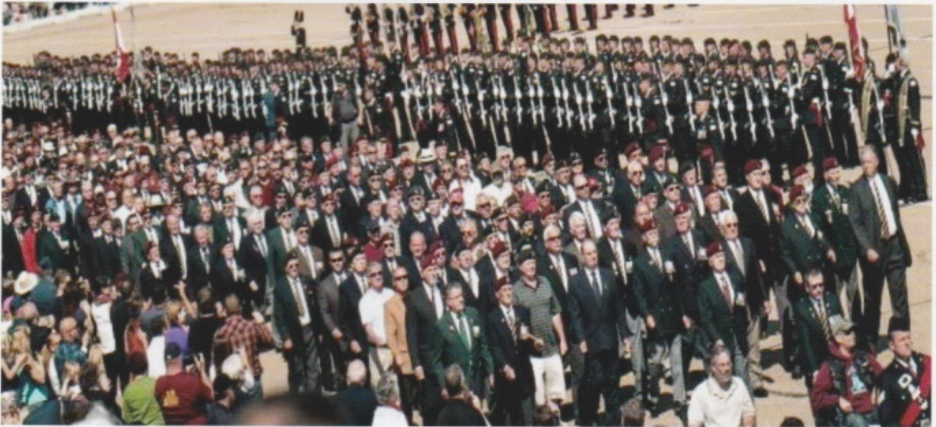
THE OLD GUARD AUGUST 2014