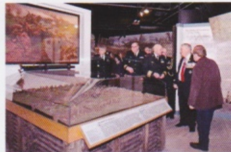
PPCLI Gallery Re-Opens: The re-opening of the PPCLI Museum Gallery in Calgary, AB marks a very important milestone for the Regiment and all Canadians as we celebrate 100 years of service by the PPCLI.