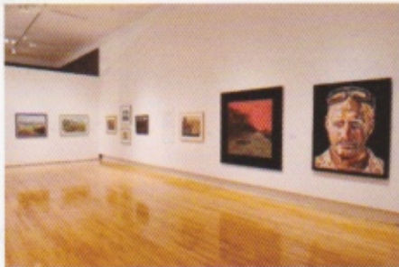
Forging a Nation: Canada Goes to War art exhibition commemorates the centennial of the beginning of the Great War. It will open at Enterprise Square in Edmonton 6 August 2014.