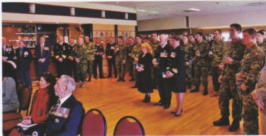
Guests and members of 3VP were on hand for the presentation at old Work Point barracks