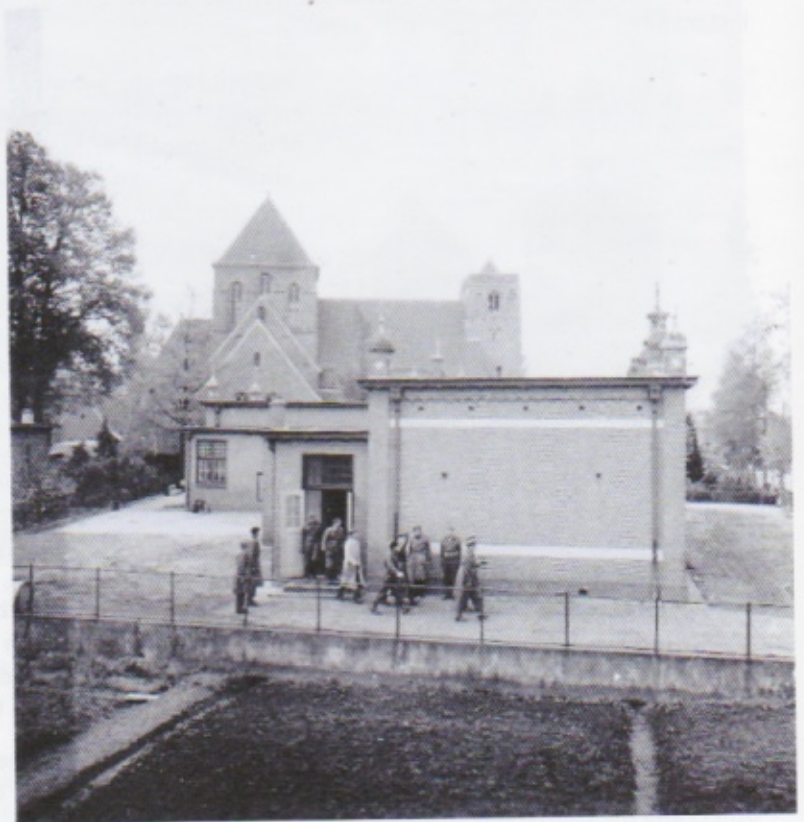
Scene of negotiation for armistice between Canadian 1 Corp and Germans

The people of Holland have never forgotten the Patricias and have honoured their contribution to the liberation of the Netherlands with five memorials in the path of their historic advance on April 1945.