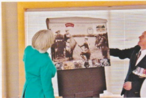
Lt Gov Guichon and LGen Foster presents the PPCLI Centennial Postal Envelope

https://www.facebook.com/nicholas.kerr.9/media_set?set=a.488496791273726&type=1