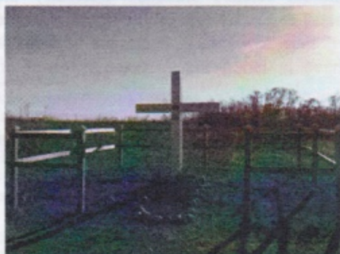
Wainwright Frezenberg Cross

Mark your calendars next year for 13-15 May 2011. Come on out to Wainwright and renew old acquaintances and visit your old stomping grounds.