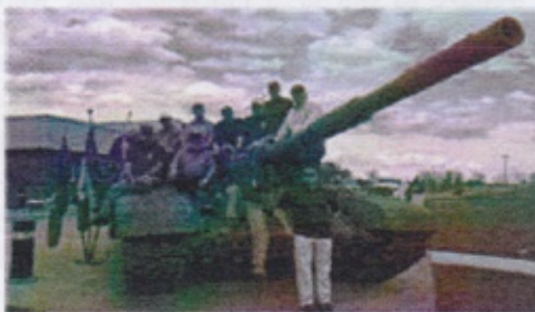
Calgary branch members at the First Anniversary of the New Military Museum