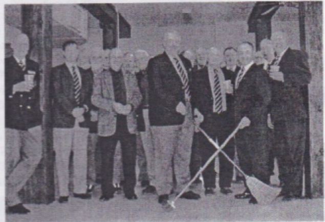
The "Undefeated" Broom-i-Loo Team