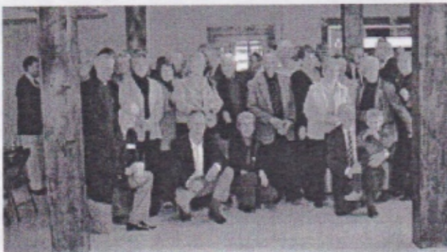
March 17 at Connaught Ranges

The Ottawa Branch had a very quiet period from last fall right into the late spring/early summer of 2006. The 17th of March gathering was held at lunch at the new mess facilities of Connaught Ranges. We had a good turnout and even had a team for Broom-i-Loo but no opposition. Therefore we remain undefeated.