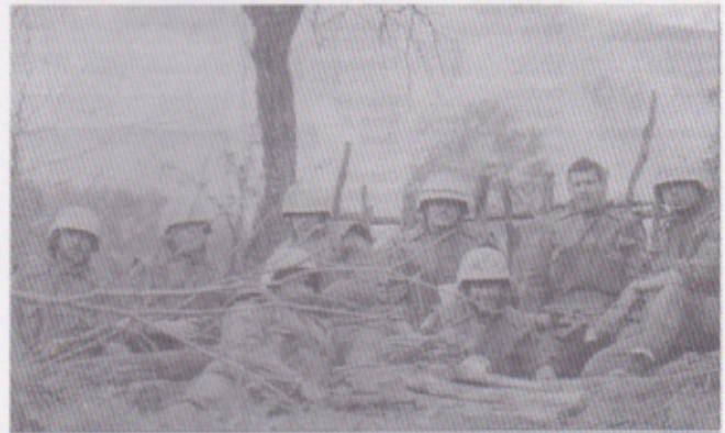
Charlie Company demonstrated that the UN was ready to use deadly force to back up its mandate in Croatia.

(Published in the Winnipeg Free Press July 16, 2002)