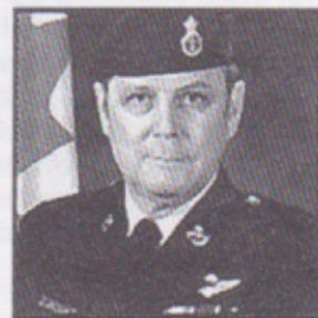
General John de Chastelain, OC, CMM, CH, CD

I am pleased to have the occasion to write this brief note for the Association Newsletter as we move into the 2002/2003-winter period.